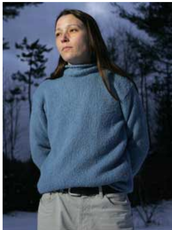
From the Globe & Mail Website, Friday, February 10th.