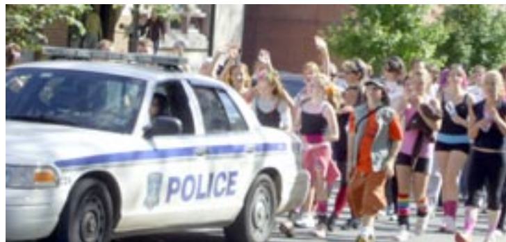
Scenes from the Halifax Walk For Life