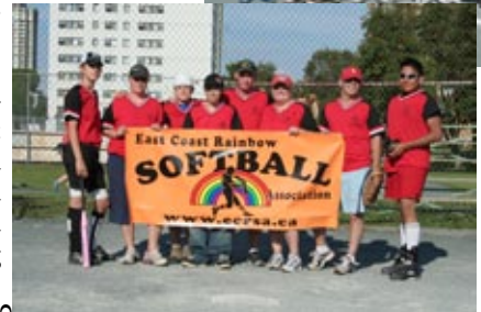
Upper photo: Mollyz, Lower photo: Pirates