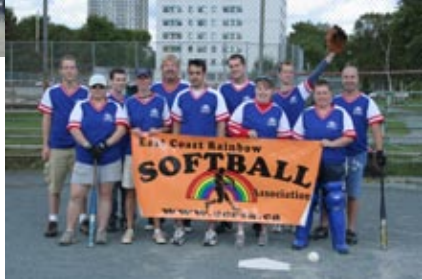
Upper photo: C-Vision, Lower photo: Blue Moon