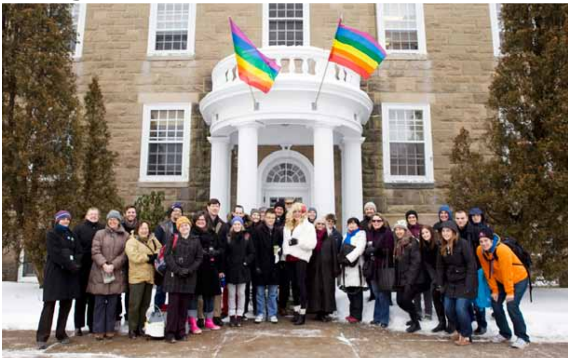
Raising the rainbow flag on February 6 at StFX to kick off Pride Week, February 6-10.