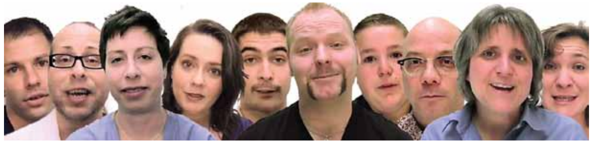
On January 20 prideHealth premiered a joint Capital Health and IWK It Gets Better video, which featured GLBTIQ staff from both organizations sharing their personal experiences as GLBTIQ youth, coming out, and their advice to present day youth that life does get better, and that it is worth living. The video has been added to the international movement against bullying of GLBTIQ youth, and is now available on YouTube, www.itgetsbetter.org , and through Capital Health NS's social media channels. You can watch the video at www.youtube.com/watch?v=5c-Cm3MZ80I .

NEXT ISSUE DEADLINE: First Friday of the Month