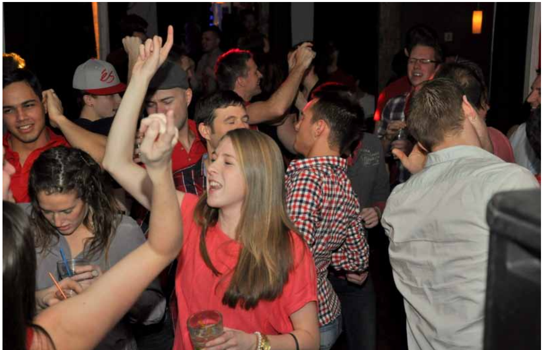
The Guerillas shake their red hot booties on the dance floor.

On February 29, 2008 in Halifax, Nova Scotia, a big group of queers dressed in pink showed up at Tribeca and transformed the club into a gay bar for the night. Four years and 36 takeovers later Guerilla GayFare Halifax is still going strong.