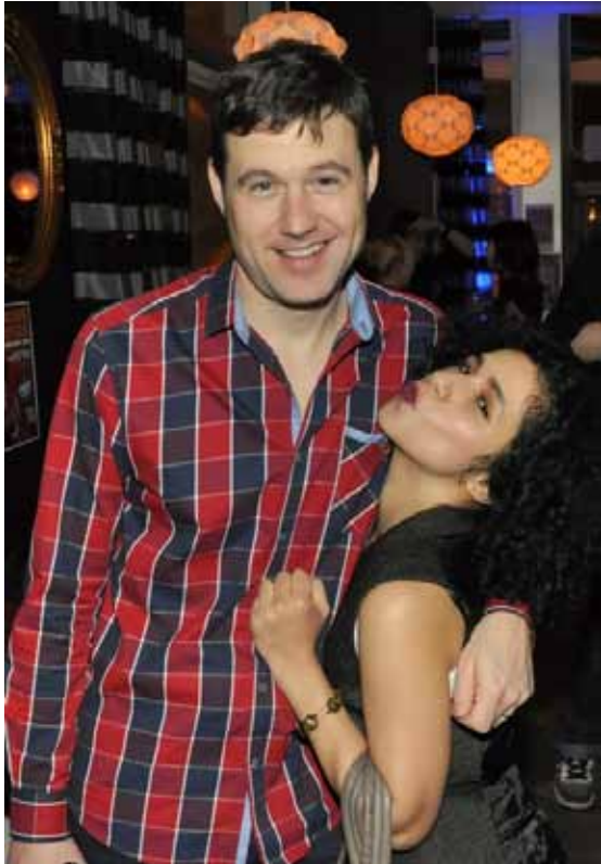
Striking a pose.

For those who have been hiding under a rock, Guerilla GayFare is a bunch of Gays, Lesbians, Bis, Trans, Fagnets, Faghags, Staghags and the like who homo it up and “take over” a straight bar the last Friday of every month. Each takeover the guerillas are assigned a specific dress code, usually a colour, pattern or some other identifiable theme.