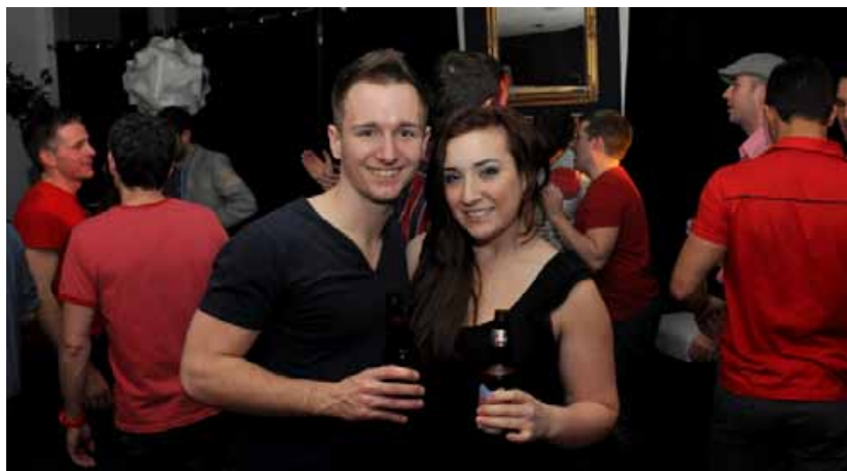
Parting the red sea.