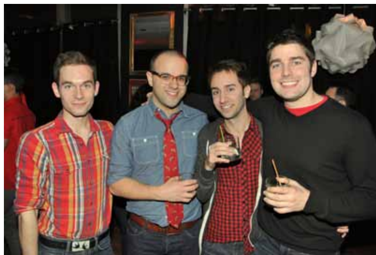
Boys in red.