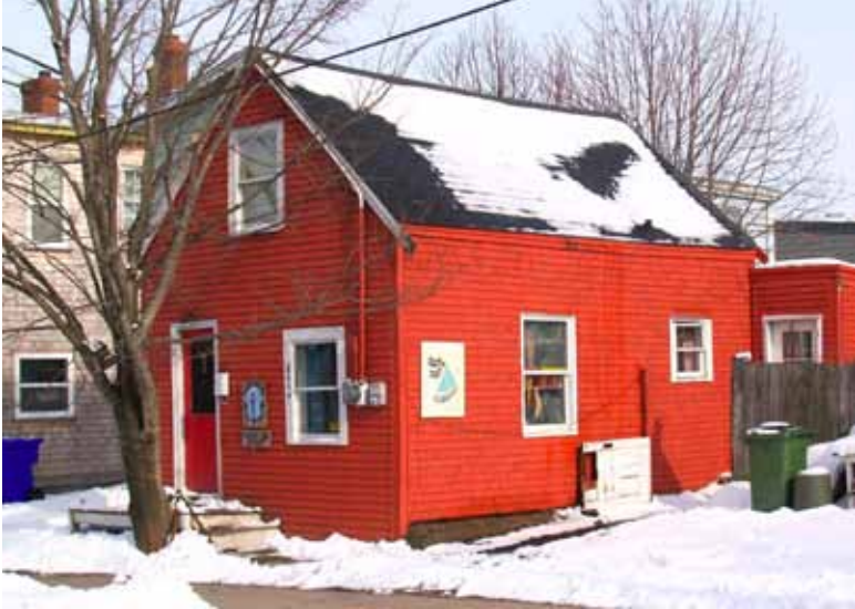
The little red house in Roberts Street.

After seven years of activity, the Roberts Street Social Centre is entering a time of change. Just before New Year's they received notice that the lease on their building at 5684 Roberts Street will end as of May 1, 2012. Members of the collective met on January 9 to begin discussing how to deal with this news.