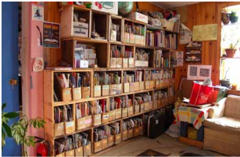
The Anchor Archive Zine Library.

The Roberts Street Social Centre is a collection of projects dedicated to providing free or affordable access to independent and alternative media, art, and education. Projects that are part of RSSC include the Anchor Archive Zine Library, the Ink Storm Screen Printing Studio, the People's Photocopier, the Crow's Nest meeting space, and an artist and zine-making residency program.