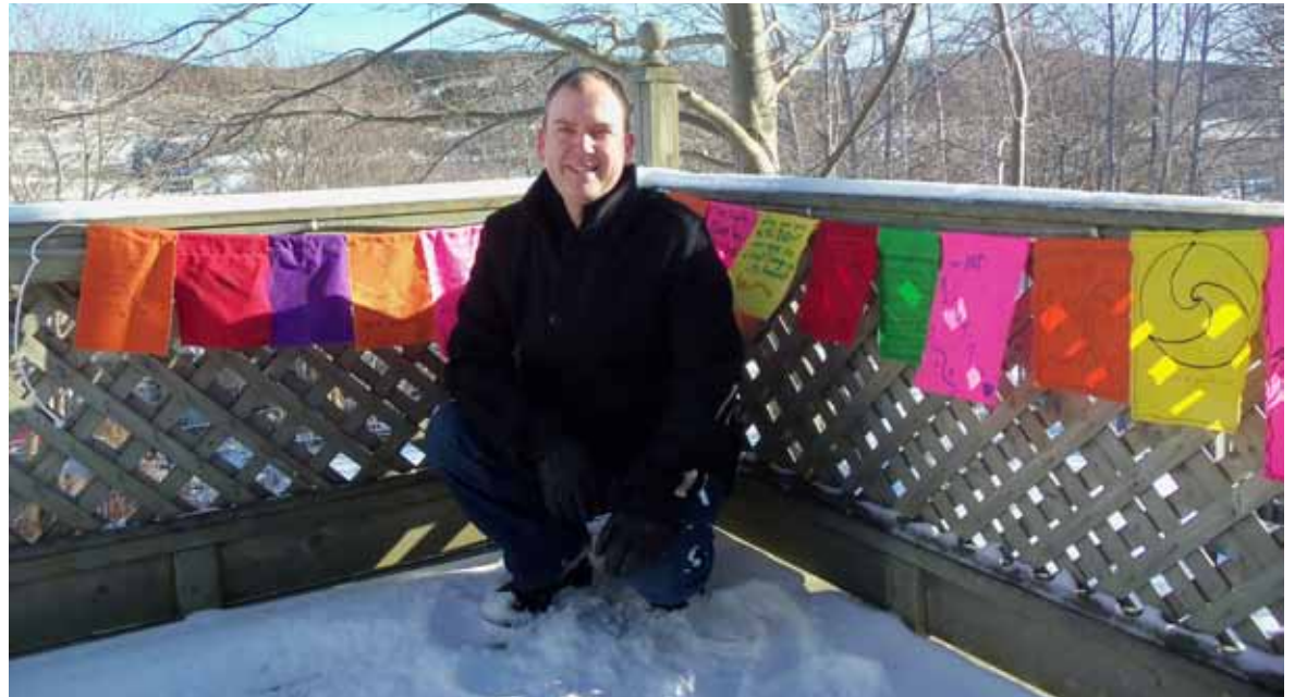
On January 25, 2012 Planned Parenthood's LGBTQ Youth Group in St. John's NL created a peace banner. Each youth and adult mentor created a unique flag, sending out positive energy and peace to the world for 2012!