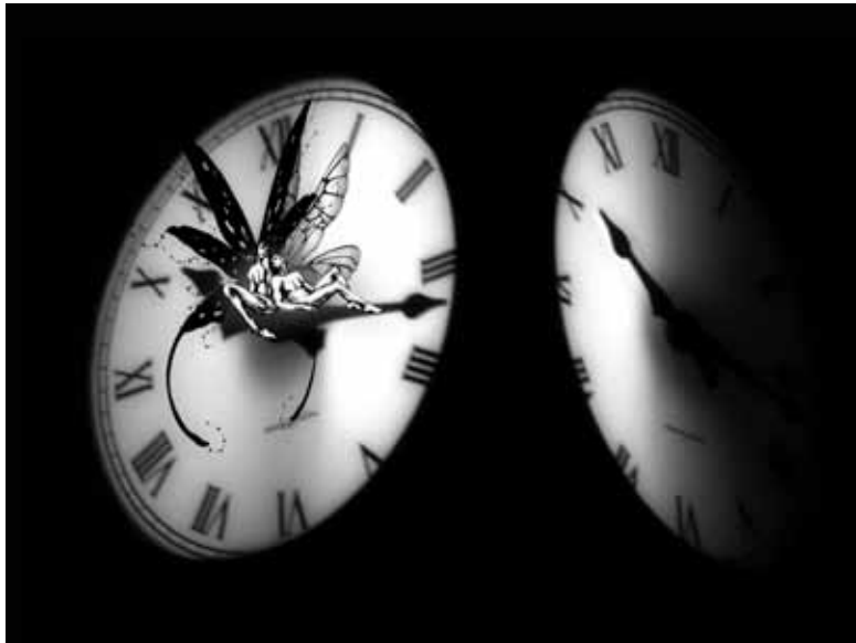
One of the pictures that will be exhibited at ViewPoint Gallery in June. Go see it.

If erotic males fairies captured in loving and playful poses entices your imagination than the upcoming June 2012 art show for at Viewpoint Gallery is where you need to be. The show entitled the 'Playgrounds of the Faerie' allows the realms of man and