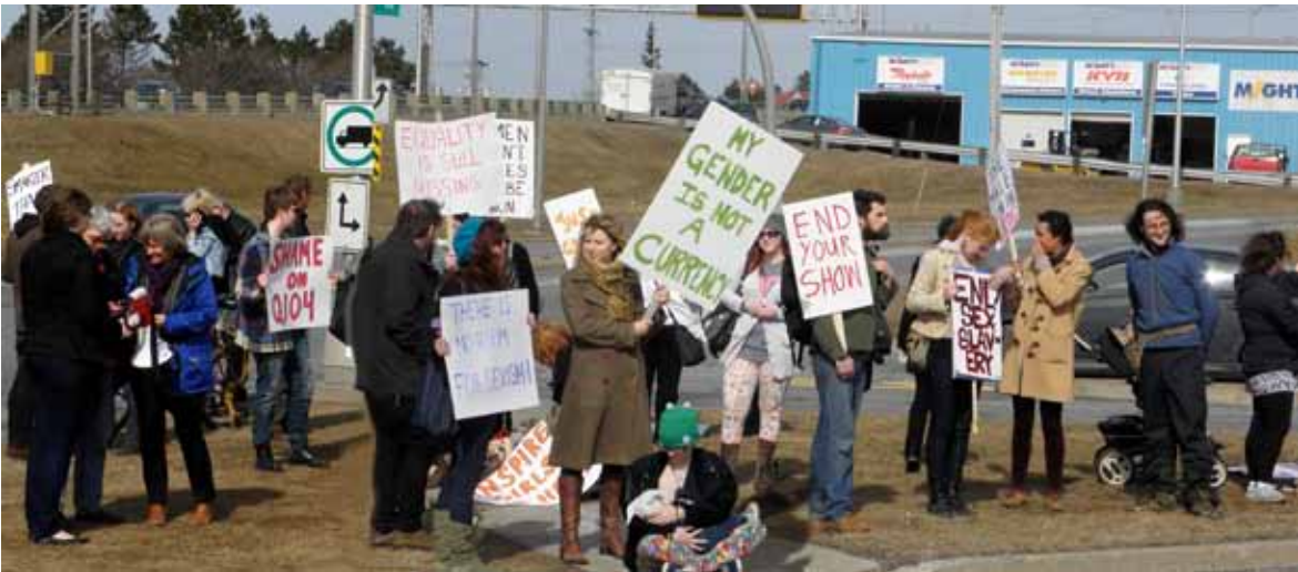
Many of the people who had been at the IWD march and their supporters joined together to participate in a protest against a contest that was being put on by Q105, where the prize was to be won by a man. The prize was a woman from Prague.