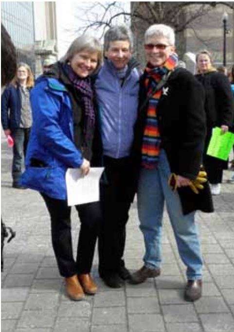
Old friends, new friends, and families gathered on International Women's Day, March 8th, to celebrate the day—a great sunny day for the event.