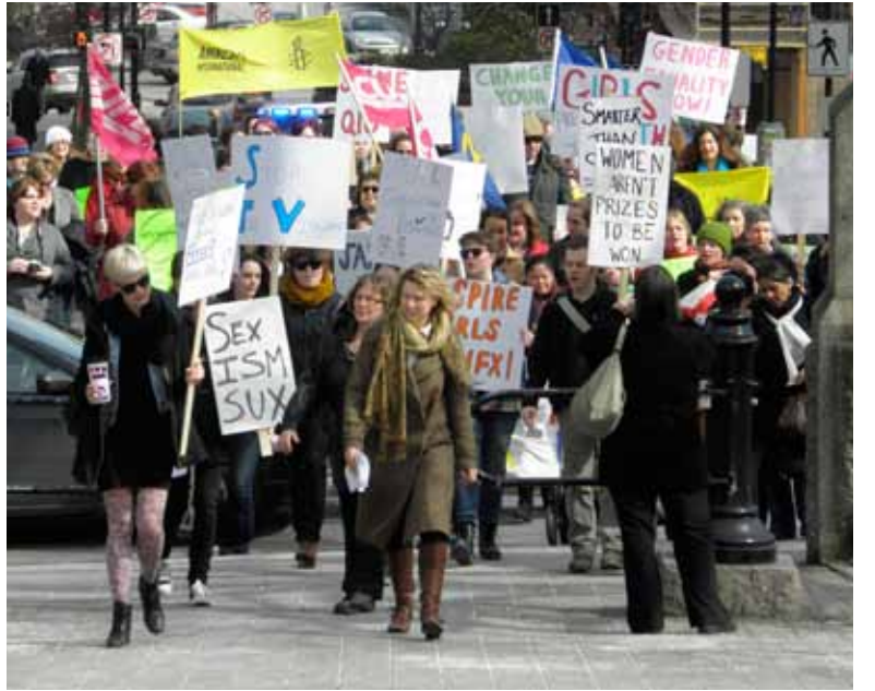
The Rally ended with a March joined by many others who chanted with great enthusiasm, heard by many in the central downtown area.