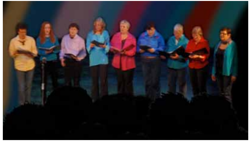
One of five Feminist Choruses of Nova Scotia who returned for a concert at Alderney Landing Theatre to kick off an incredible week for HRM's International Women's Week 2012. Kudos to everyone involved in making it the best IWD in years!